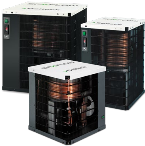
Efficient Smooth Copper Heat Exchangers

Customers around the world have relied on Deltech for great value in air treatment solutions. Deltech Refrigerated Dryers offer a simple solution based on a long history of industry leading technology.