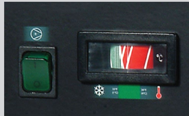
Controls: Models 75 - 150 scfm