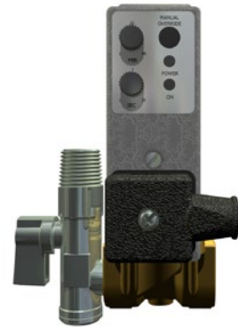
Adjustable Timed Electric Drain for HGEN Models 75 - 150 scfm