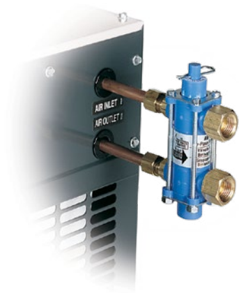
Air Bypass Valve