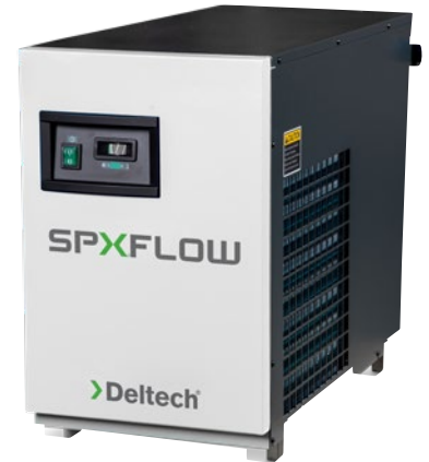
Model Shown: HGEN75