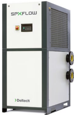
Model Shown: HGEN1200