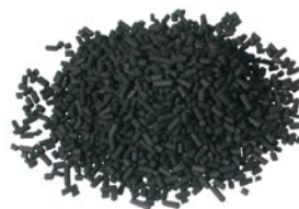
HGS Series Pelletized activated carbon adsorbs trace lubricants