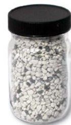
HPE Series Magnetized zeolite absorbs polar formulations